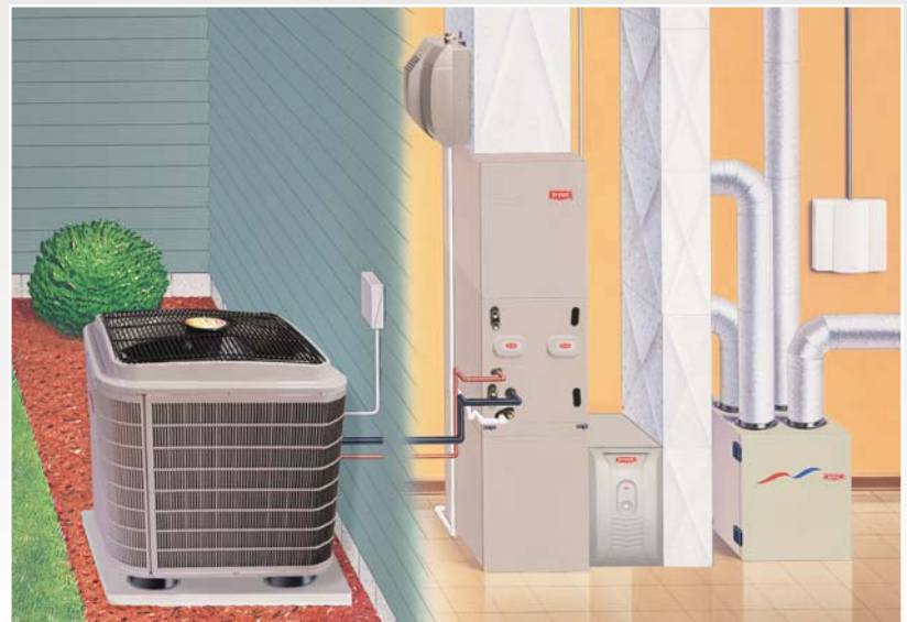
Heat Pump and Fan Coil System