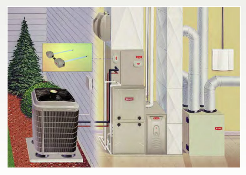
HYBRID HEAT® Dual Fuel System with Evolution® V Heat Pump and Evolution Gas Furnace