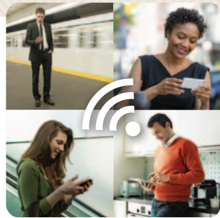
Access anytime, anywhere

The Bryant® Housewise™ thermostat can make your life easier in more ways than one. Not only does your Bryant® dealer deliver and install your Housewise™ thermostat, you can even choose to have your dealer monitor your system's performance.