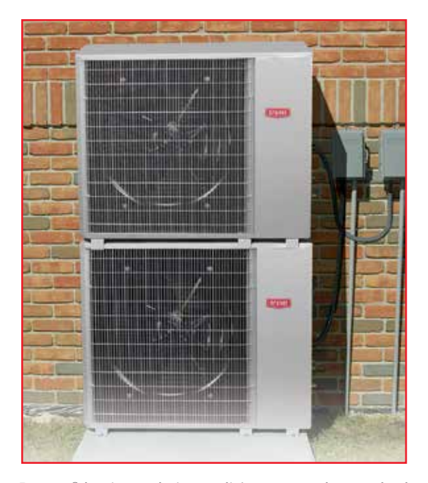
Bryant® horizontal air conditioners can be stacked for greater output and zoned comfort control.