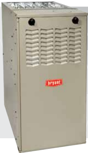
Models 880T and 881T