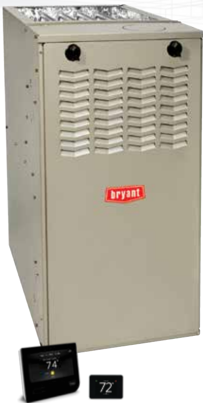
Control and Smart Sensor sold separately